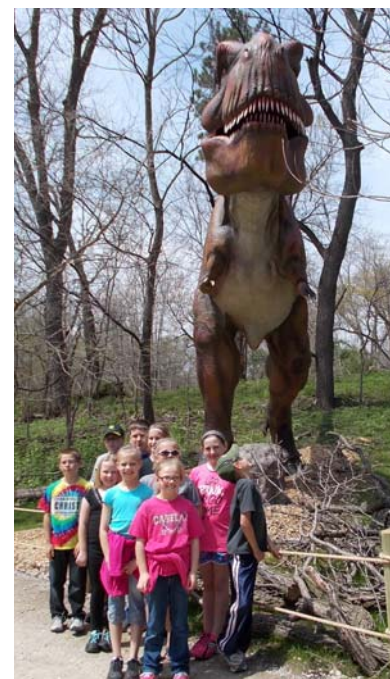
The 3-4-5 Grade class at Dinosaurs Alive.

The whole school spent an afternoon at Camp Luther. Grades K-3 had an ABC Scavenger Hunt and picked up sticks so the camp could mow. Grades 4-8 picked up trash on the trails and then had fun on the rope swing.