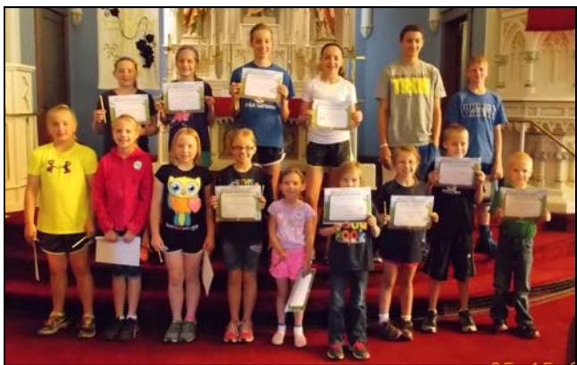
Students receiving the BUG Award.