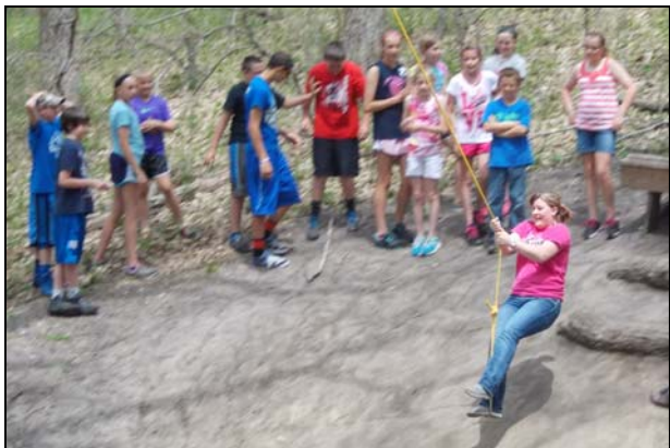
Students enjoying the rope swing at Camp Lutheran.

Grades K-1-2 headed to Norfolk where they toured Big Apple Bagels, the Elkhorn Valley Museum, had lunch at Culver's, then toured the Norfolk Arts Center and Affiliated Foods before heading home. One of the highlights of their trip was an opportunity to take a picture with a wax figure of Johnny Carson!