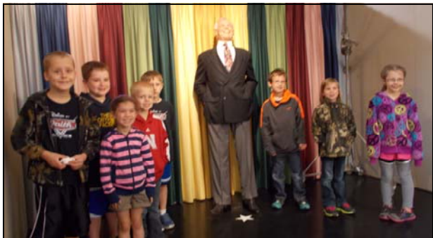
K-1-2 at the museum in Norfolk.

Each classroom organized field trips held during the last few weeks of school. Grades 3-4-5 headed to Omaha to the Henry Doorly Zoo. They spent the day touring the zoo and were able to see a special exhibit "Dinosaur's Alive."